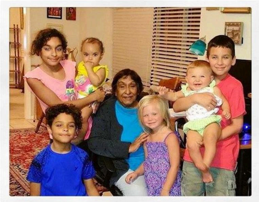
mAmAn bozorg with most of her grandkids